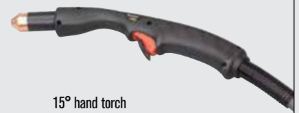
15° hand torch