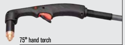
75° hand torch

(for more torch options, see www.hypertherm.com )